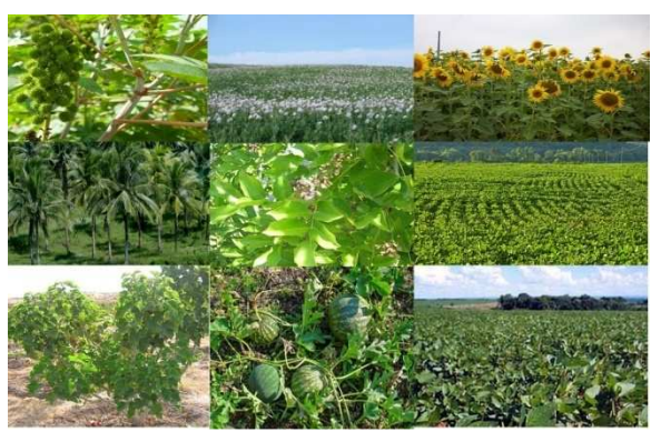
Figure 3 Biofuel Plants

The oil from oil-bearing and oil-producing plants is regularly concentrated primarily in the fruits and seeds. The roots, stalks, branches, and leaves may also contain some oil but, in general, the quantity is very much lower. The oil content of some seeds and fruits can be as high as 35%. For example, in dried coconut meat (commonly termed copra) the oil content can be as much as 60 to 65%. In several seeds the oil is mainly found in the germ or embryo, which generally constitutes only a small part of the seed. In the case of the olive, however, a major portion of the oil is found in the pulp surrounding the kernel and only a small portion in the kernel itself. But in the case of the oil palm, both the pulp and the kernel include large amounts of oil. In general, the oil from the pulp may have characteristics somewhat different from the fat from the kernel.